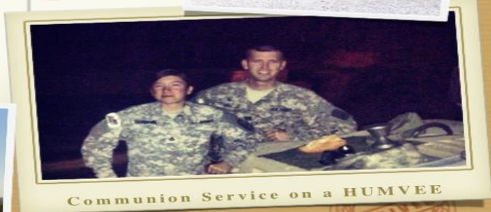
Communion Service on a HUMVEE